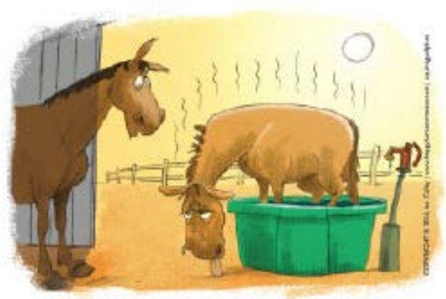
"I WAS GOING TO DRINK THAT. ... UH, NEVER MIND."