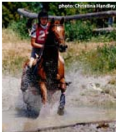
Reeva 1986 - 2012

competed successfully up to Training level as an Eventer. Reeva loved to swim in the lake, long hacks in the woods and lots of cuddles, nuzzles and treats in her stall.