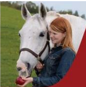
promoting health & performance