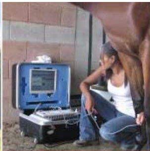
funding industry research