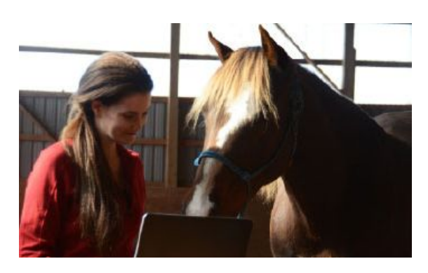
New 12-Week Courses Start May 6th