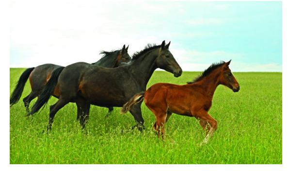
Upcoming Horse Portal Short Courses

Gut Health & Colic Prevention (Racing Focused)