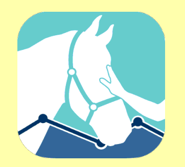
Download an awesome new APP Horse Health Tracker by Equine Guelph