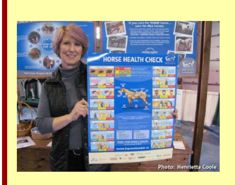
Buy your barn the Horse Health Check Poster - a fantastic reference tool!