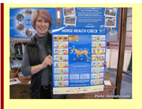
Buy your barn the Horse Health Check Poster - a fantastic reference tool!