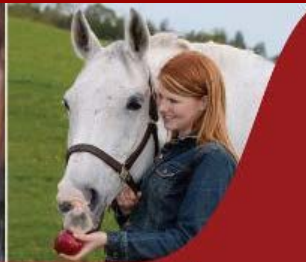
promoting health & performance