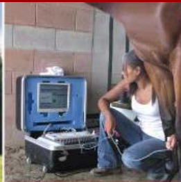
funding industry research